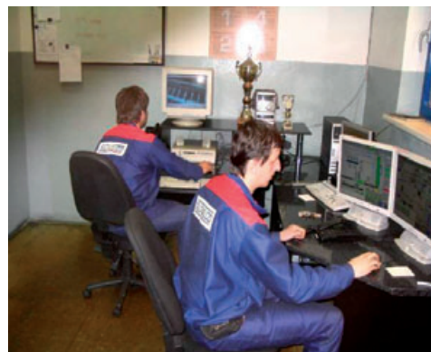
Visual inspection of blocks before and after automation.