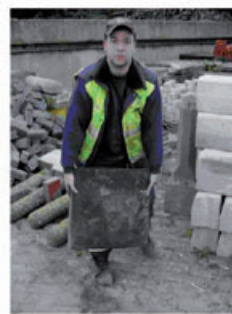
The measures sought to remove risks such as handling heavy tiles.

The City of Delft has more than earned back its investment, thanks to a reduction of 3.9% in absence due to illness. A survey on physical stress carried out before and after the measures were introduced revealed a drop in exposure to physical stress. More importantly, the status and motivation of the workers were enhanced because they felt a sense of "ownership" over the measures.