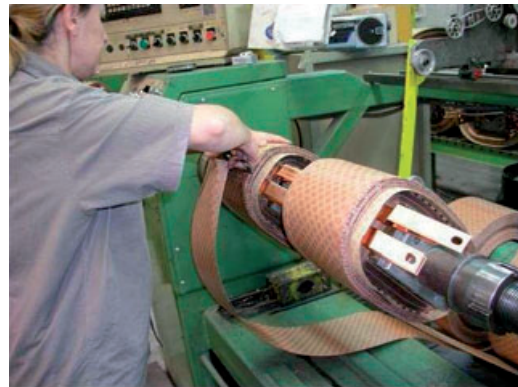
Before - working with raised arm and elevated shoulder.

Other improvements included the installation of an automated conveyor of adjustable height in the assembly department and an adjustable angle table for the easy and safe turning of the transformer's armature. Training for operators complemented the improvements in equipment and the redesign of the assembly line.