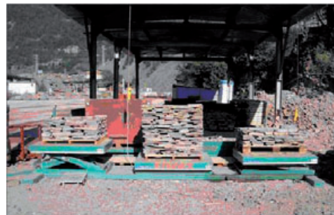
Improved workstation following the introduction of the new measures.