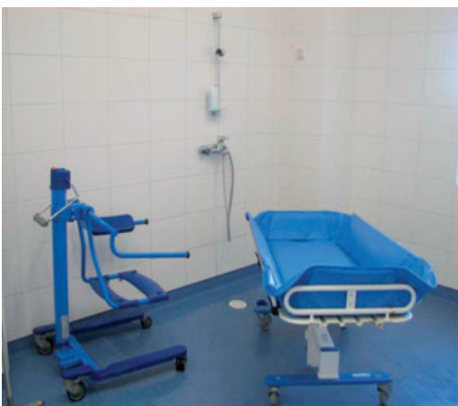
A patient lifter and shower stretcher.

Following a risk analysis, the hospital introduced a number of measures to reduce the physical load on the workers. The technical measures included installing handrails in corridors to enable patients to move around without help from staff.