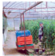
The tomato transport system.

This simple load moving system has eased the production process and substantially decreased the manual handling risks to workers. Since its installation, no complaints of back pain have been received from the employees.