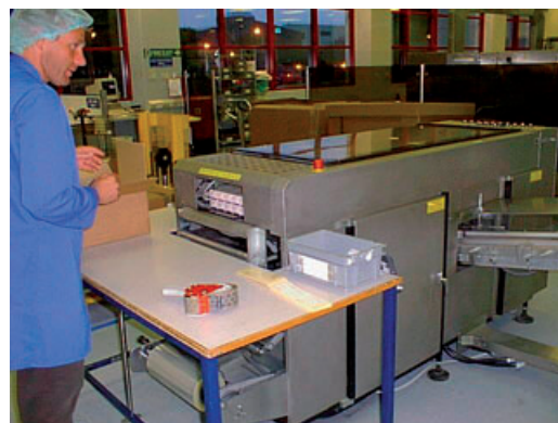
Before and after adjustments were made to a workstation.