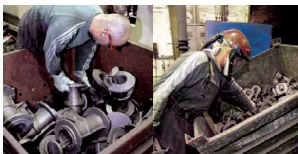
Lifting cast parts before and after the introduction of lifting/tipping containers.

Workers were given time to familiarise themselves with their new working conditions and were offered support from the team. Further analyses and measurements were performed to ensure that the measures had improved the working conditions without introducing new strains.