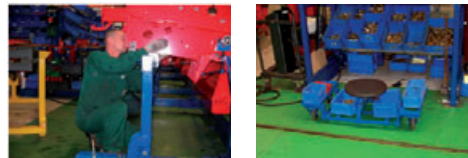
Problem (left): working in a low squat position for long periods with arms above shoulder-level - Solution (right): using a rolling stool side-boxes to hold working material.

At all stages, it was important to raise apprentices' awareness of ergonomics.