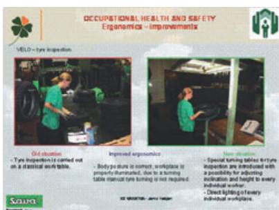
Before and after adjustments were made to a workstation.

A multidisciplinary team involving management, workers, OSH experts, occupational health doctors, construction designers and other specialists assessed the ergonomic problems, proposed solutions and monitored their implementation.