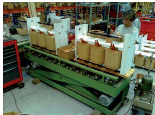
After - automated conveyor of adjustable height.