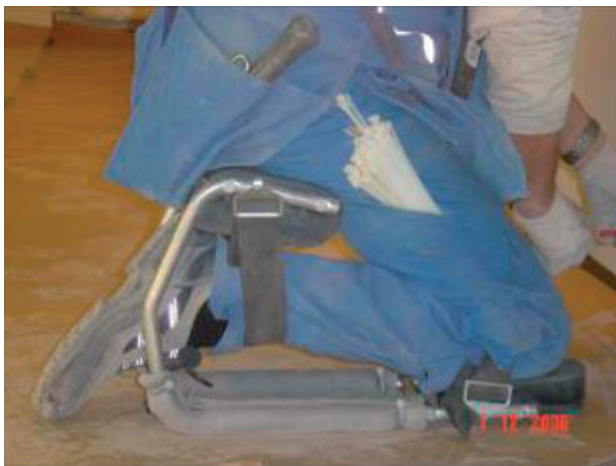
A special device was introduced to protect knees. The device also functions as a stool.

Bringing together many different actors in the power network construction industry, along with those in technical building services, and including trades unions and employers' organisations, information on risks was gathered through risk assessment and analysis of past accidents. Workers were also asked about their working conditions. The work methods were videoed and photographed so they could be assessed at a later date.