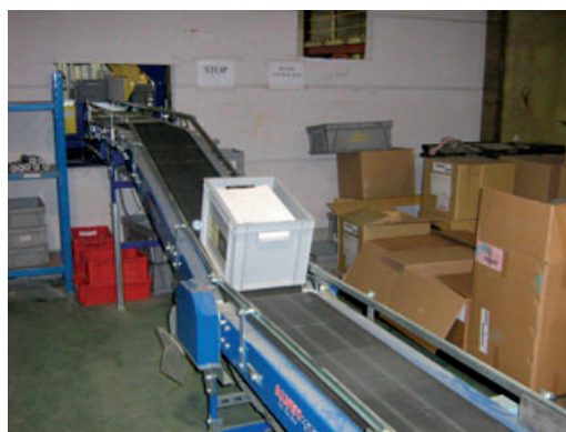
A conveyor belt brings a warehouse crate to the counting area automatically.

At the request of workers, standing workplaces were replaced by sitting units, which will help to reduce back strain. To cut occupational accidents, production was reorganised to anticipate bottlenecks, allow better planning of the workforce and avoid time pressures. Quality control is now integrated into the production stream to avoid extra manipulation. Only one trained person is now responsible for the system supply and in possession of a break knife, instead of all workers as was previously the case. A fixed, slower tempo guarantees production capacity without putting the workers under stress.