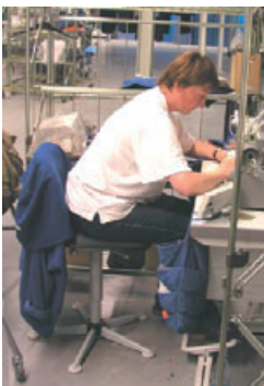
A workplace before new measures were introduced: the worker is strongly bent forwards at a workbench that is too low, with too little room for her legs.