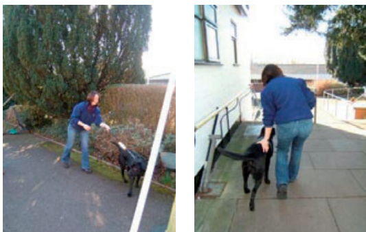
Asymmetric strains on guide dog trainers by left-handed dog training.

A high prevalence of MSDs and absenteeism was noticed, yet trainers/instructors were rarely aware of the risks. They enjoyed their jobs and considered "aches and pains" a part of it, which led to a high level of under-reporting of illness.