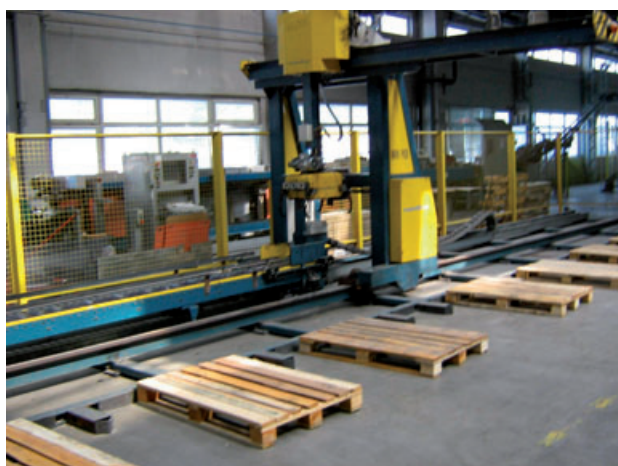
Automation of the tile-sorting line.

As a result of the risk assessment, it was decided to modernise the unit that put tiles on pallets. Two robot manipulators were installed to replace eight of the 16 workers. Following automation, the workers were trained to manage the computer-controlled mechanism.