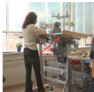
Example of a redesigned workstation with arm supports and adjustable height. An electromechanical system is used to incline the table.